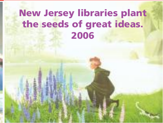
New Jersey libraries plant the seeds of great ideas. 2006