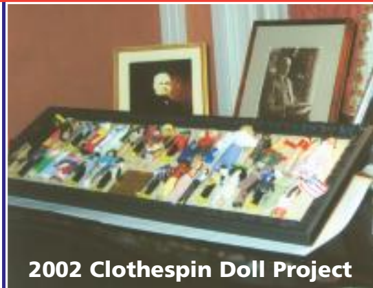
2002 Clothespin Doll Project