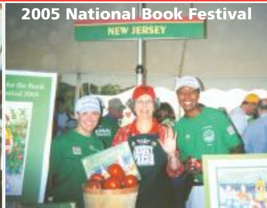
2005 National Book Festival